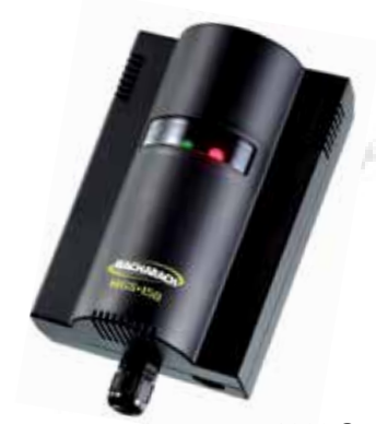
6300 Series Wall